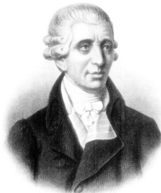
Franz Joseph HAYDN