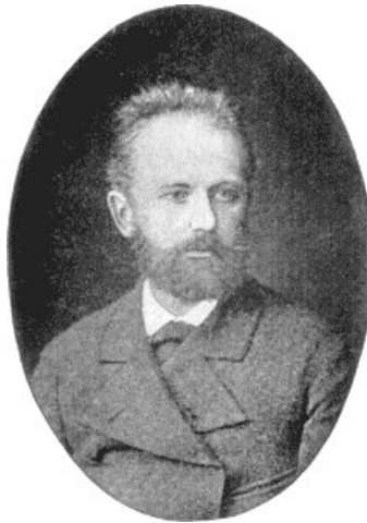
Pyotr Ilyich TCHAIKOVSKY