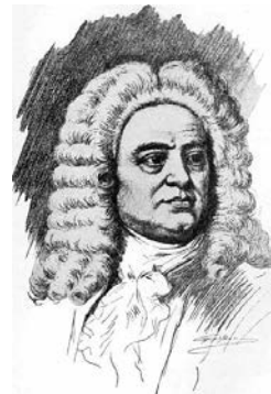
GEORGE FRIDERIC HANDEL