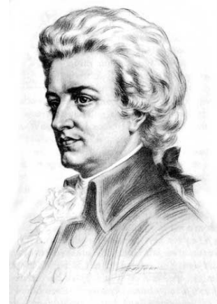
Wolfgang Amadeus MOZART